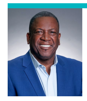
Byron L. Lee New Orleans, LA Affiliation: President of the Senate