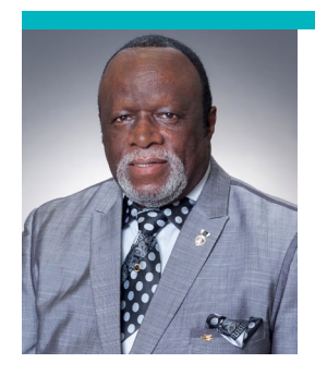
Franklin, LA Affiliation: Congressional District 3